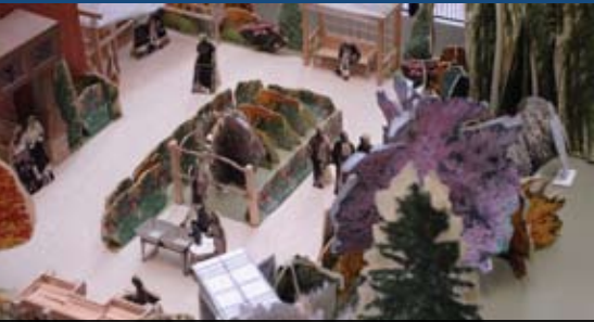
A model shows garden elements placed in the center and around the perimeter of a wide, circular path.