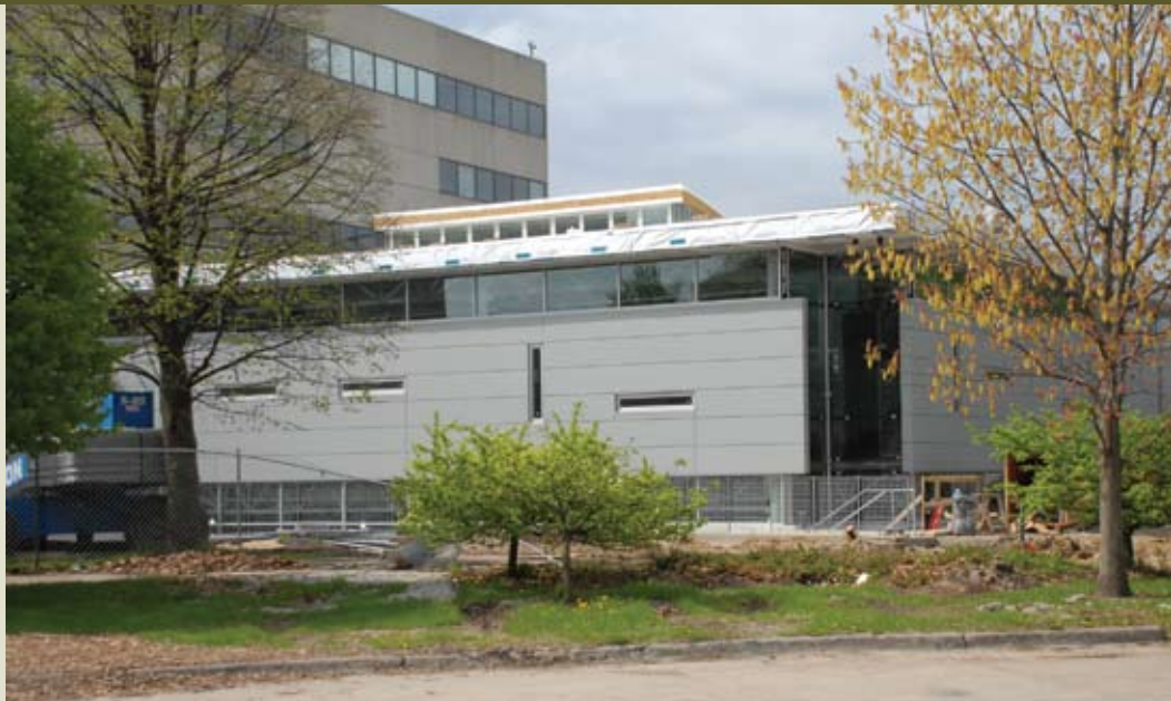
Construction was substantially completed on the King Pavilion in early May. As of press time, the building still awaits planting of its green roof, and crews continue to finish interior details. It will be open for fall classes and dedicated on August 24.

More information will be forthcoming, in the monthly Designotes e-blast and posted on our website at www.design.iastate.edu/30/index.php as well as other communications. Make plans now to join us for this exciting night of events!