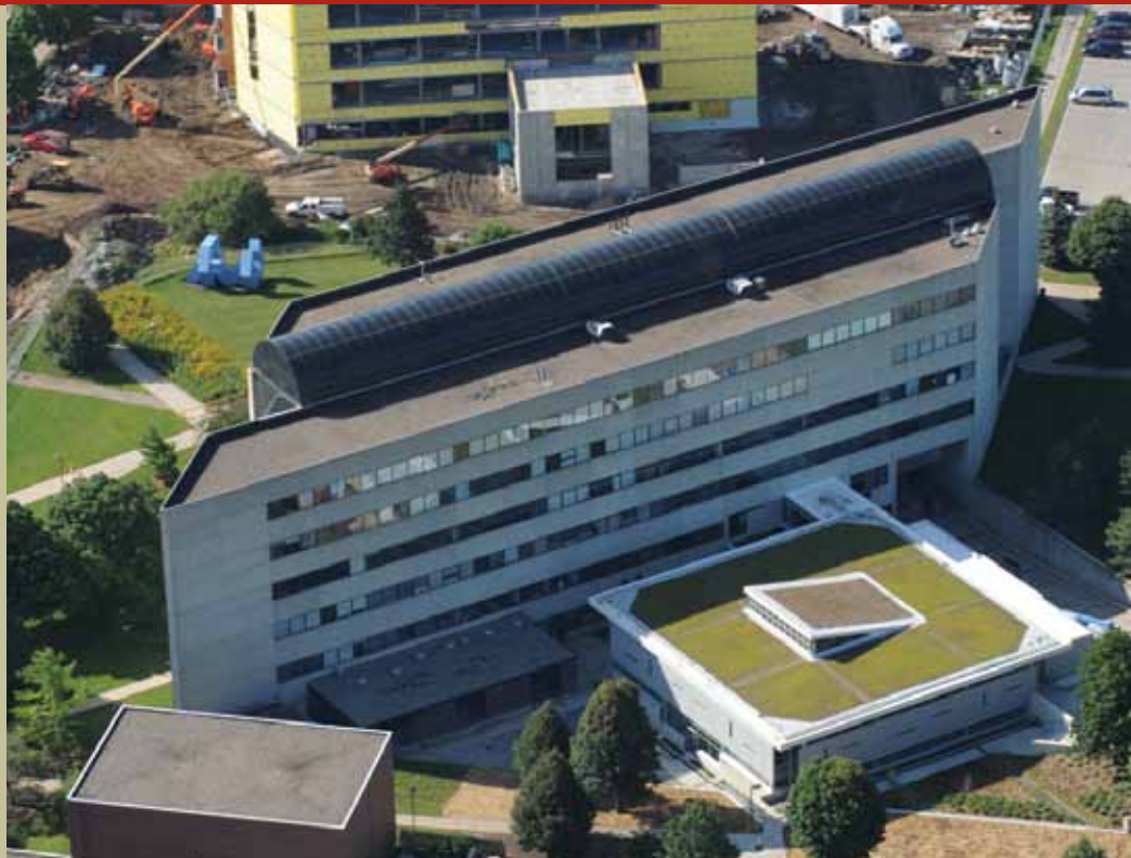
The King Pavilion's green roof is sown with 20 varieties of hardy plants atop four layers of special materials that alternately hold and release moisture. This will prevent about 80 percent of rain and melted snow from flowing into the storm sewers as runoff.

The building will be dedicated in a ceremony at 5:15 p.m. Monday, Aug. 24, in the College