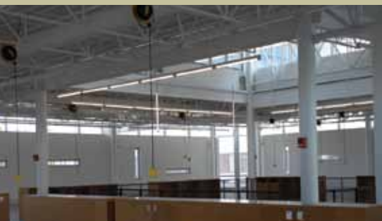
The open studio format will promote interaction and collaboration among students and faculty in different programs and classes.