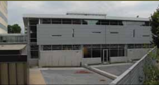
Detention cells beneath permeable pavement, like this courtyard on the northeast side of the pavilion, help slow the flow of rainwater into storm sewers.