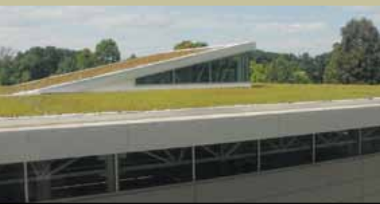
Clerestory windows provide ample natural light inside the building. Among other benefits, the green roof helps regulate the interior temperature, keeping it comfortable even on warmer days.